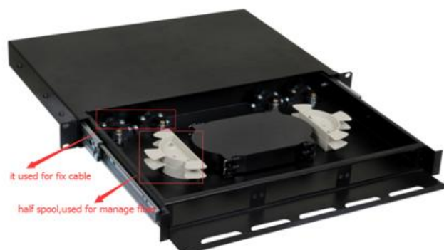
Cable management, used for fix cable and manager fiber.