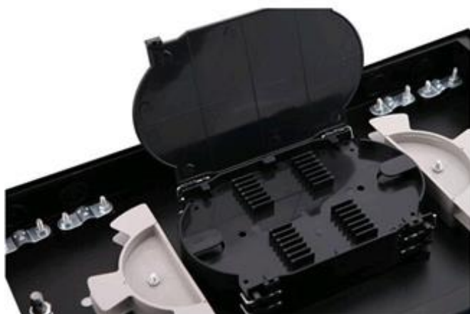
This is splice tray, it used for holder sleeves that spliced fiber.