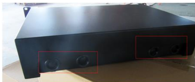
This is entry of cable. Each one can holder 3-16 mm cable to put in.