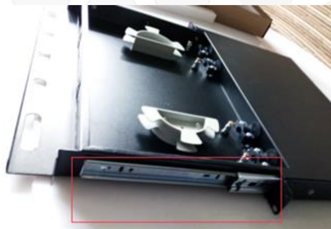
Sliding type with drawer, when operated, you can pull it out, its easy to operate.